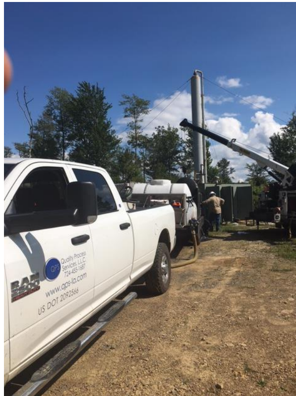
Cleaning a Dehy with the new wash trailer